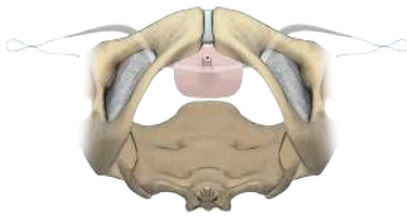
TOT In-Out approach & TOT Out-In approach